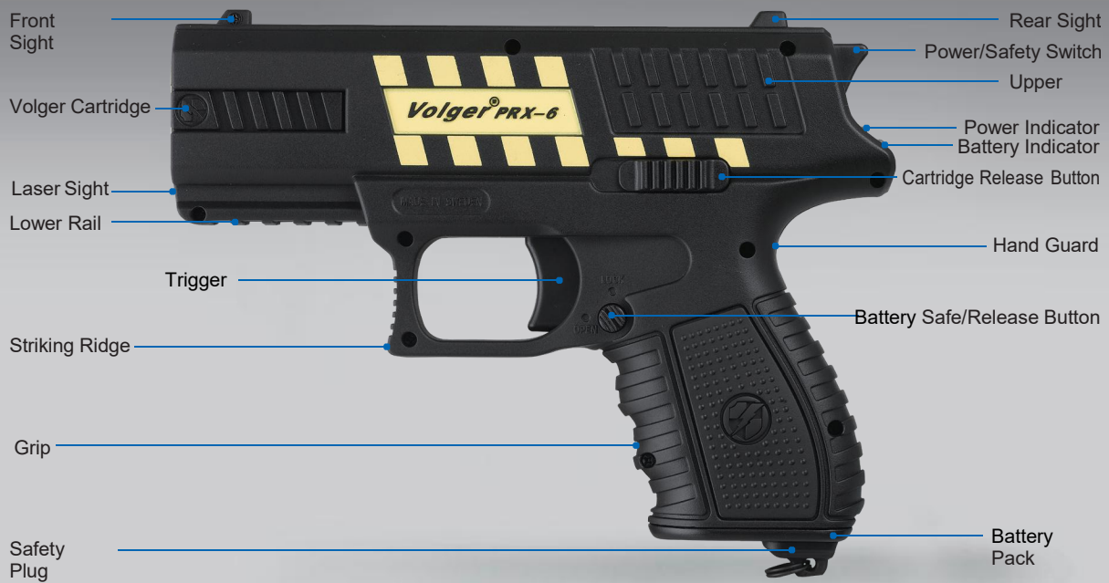
Volger PRX-6 Product Structure Diagram